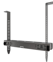
Fast Trak - Universal